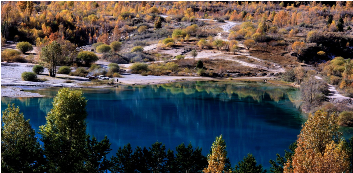
Nature beauty of Kazakhstan

A journey through the heart of Kazakhstan's nature: colorful desert hills, singing sand dunes, deep canyons, high mountain lakes, and quiet valleys. This trip also includes time to discover the city of Almaty. It's a balanced blend of adventure, rest, culture, and connection with nature