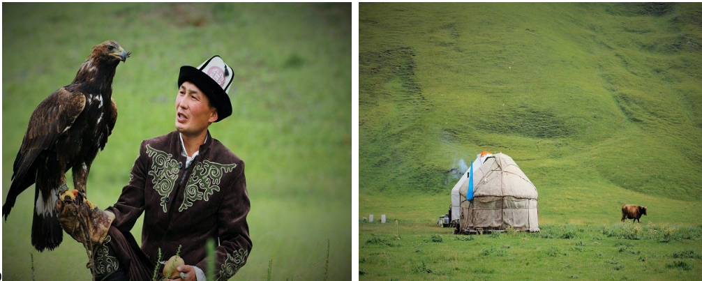
Horses seen at grassland/ Traditional Nomadic drink – ferment milk - kumys

We will drive to the green area of a rafting base on the banks of the Chilik River, where we can take part in a refreshing rafting trip, only if there is sufficient water level this season. We'll stroll through the Baiseit village market, where you can buy edible souvenirs, and dine on the village's signature shashlik.