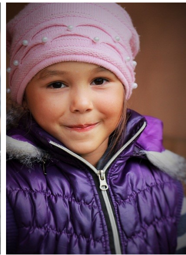
Local people of Kazakhstan/Kyrgyzstan seen in village/bazaar